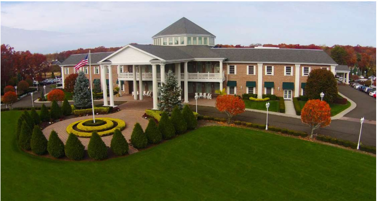
East Wind Long Island

So please help us help the helpless by joining Hope Children's Fund for an evening of fun and memories. Your participation will change the lives of some of the world's most vulnerable children . . . forever!